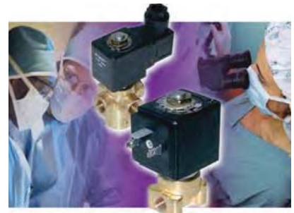
Medical / Instrumentation